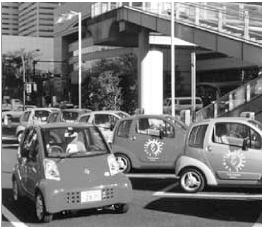
Figure 1. The ITS/EV Yokohama project uses a fleet of Nissan Hypermini electric vehicles.